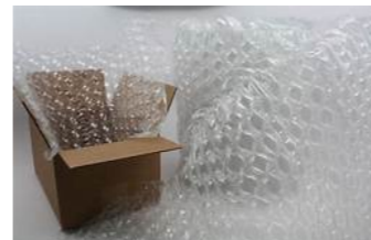
Large Bubble Wrap