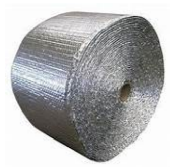
The metalized material acts as a barrier for Cold Chain shipments to help maintain consistent temperatures and avoid excursions.