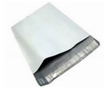
Poly Courier Mailer Available in 6x9 - 24x24