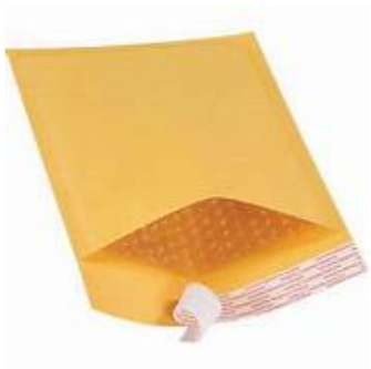
Kraft Bubble Mailer Available in # 000 - # 7