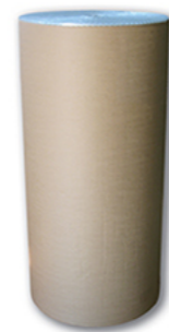
Kraft laminate increases puncture and tear resistance Moisture absorbent layer prevents surface damage due to trapped condensation