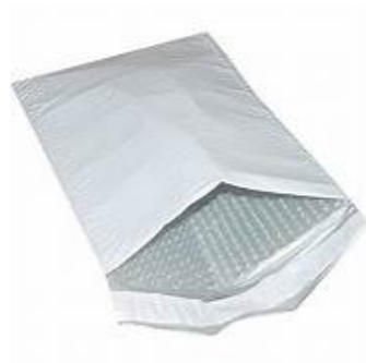
Poly Bubble Mailer Available # 000 - # 7