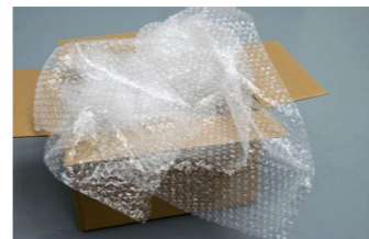
Bubble Wrap 3/16" / 5/16" / 1/2" Unmatched ability to tightly wrap around the contours of any product