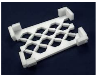
Custom Die Cut For unusual, unique or precise foam shapes