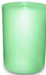
100% Polyethylene—Product is recyclable because it does not contain nylon Delivers a “green message”